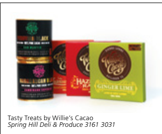
Tasty Treats by Willie's Cacao Spring Hill Deli & Produce 3161 3031