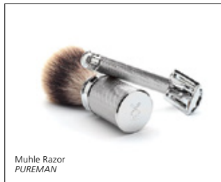
Muhle Razor PUREMAN