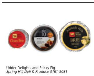
Udder Delights and Sticky Fig Spring Hill Deli & Produce 3161 3031

DISCOVER THE BEST PLACES TO EAT, DRINK, SHOP AND PAMPER YOUR TIRED LOCKS.