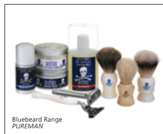
Bluebeard Range PUREMAN