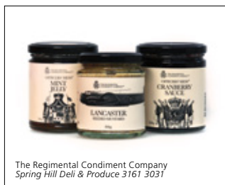
The Regimental Condiment Company Spring Hill Deli & Produce 3161 3031