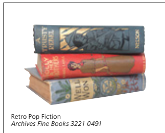
Retro Pop Fiction Archives Fine Books 3221 0491

SPRING HILL DELI & PRODUCE Shop 2, 537 Boundary Street, Spring Hill www.springhilldeli.com ARCHIVES FINE BOOKS 40 Charlotte Street, City www.facebook.com/archivesfinebooks