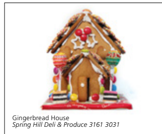
Gingerbread House Spring Hill Deli & Produce 3161 3031

SPRING HILL DELI & PRODUCE Shop 2, 537 Boundary Street, Spring Hill www.springhilldeli.com PUREMAN www.pureman.com.au